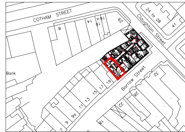
Second Floor Plan (SCALE 1:1250)