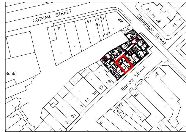
Second Floor Plan (SCALE 1:1250)